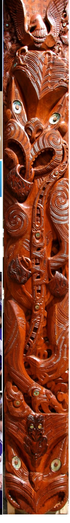
"Whāngai te iti kahurangi"