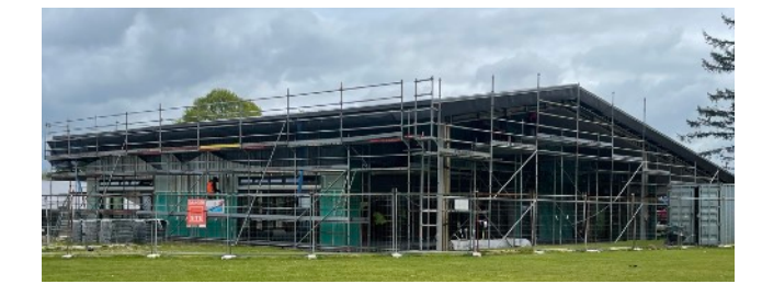
Te Tihi Ki Mānono Wharekura Block

Friday 28th of April will need to be in your calendar. We will be celebrating our 21st birthday as a kura and a day of sport. Kapa Haka and whanaungatanga is planned for all alumni (ex-students &